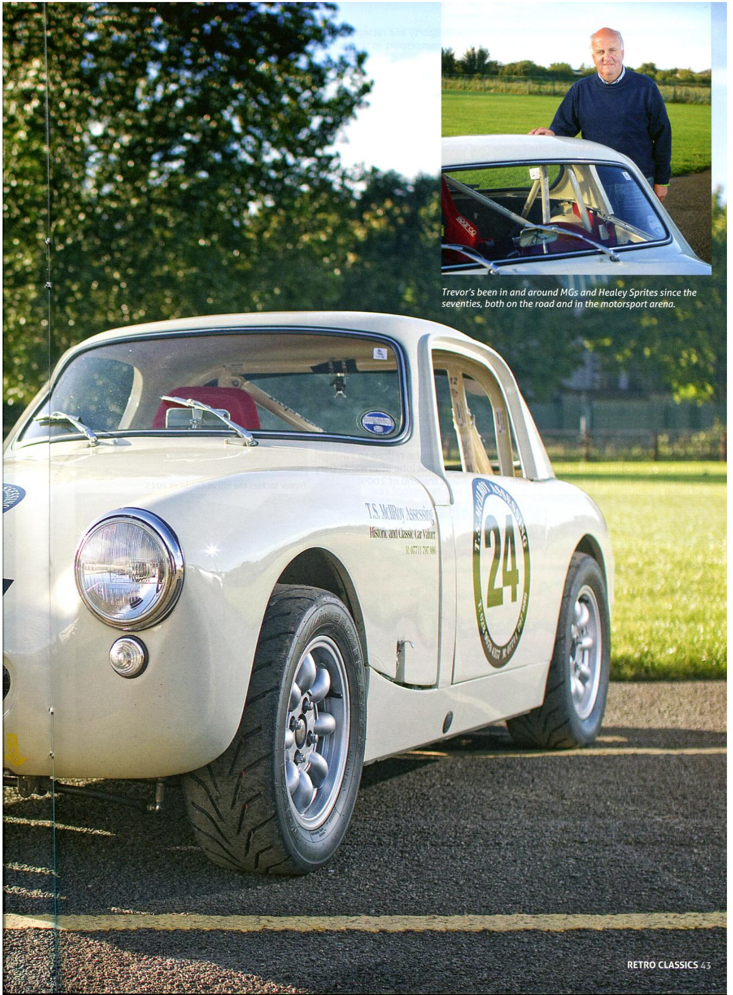
Trevor's been in and around MGs and Healey Sprites since the seventies, both on the road and in the motorsport arena.