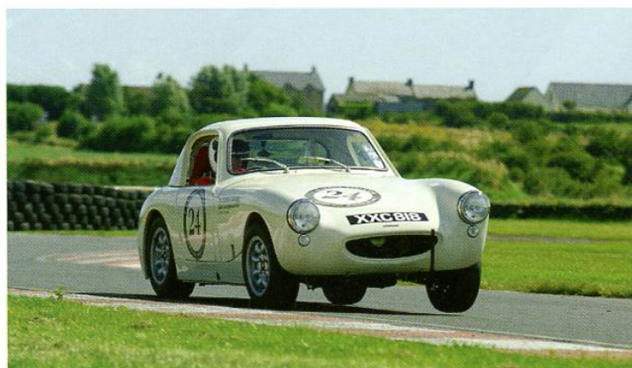
The beauty of a car like this is that it's equally at home on sprints, hillclimbs and autotests, and is even road legal for the odd Sunday blast too.