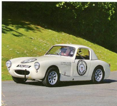
Trevor tackles the hill at Cultra in 2015.