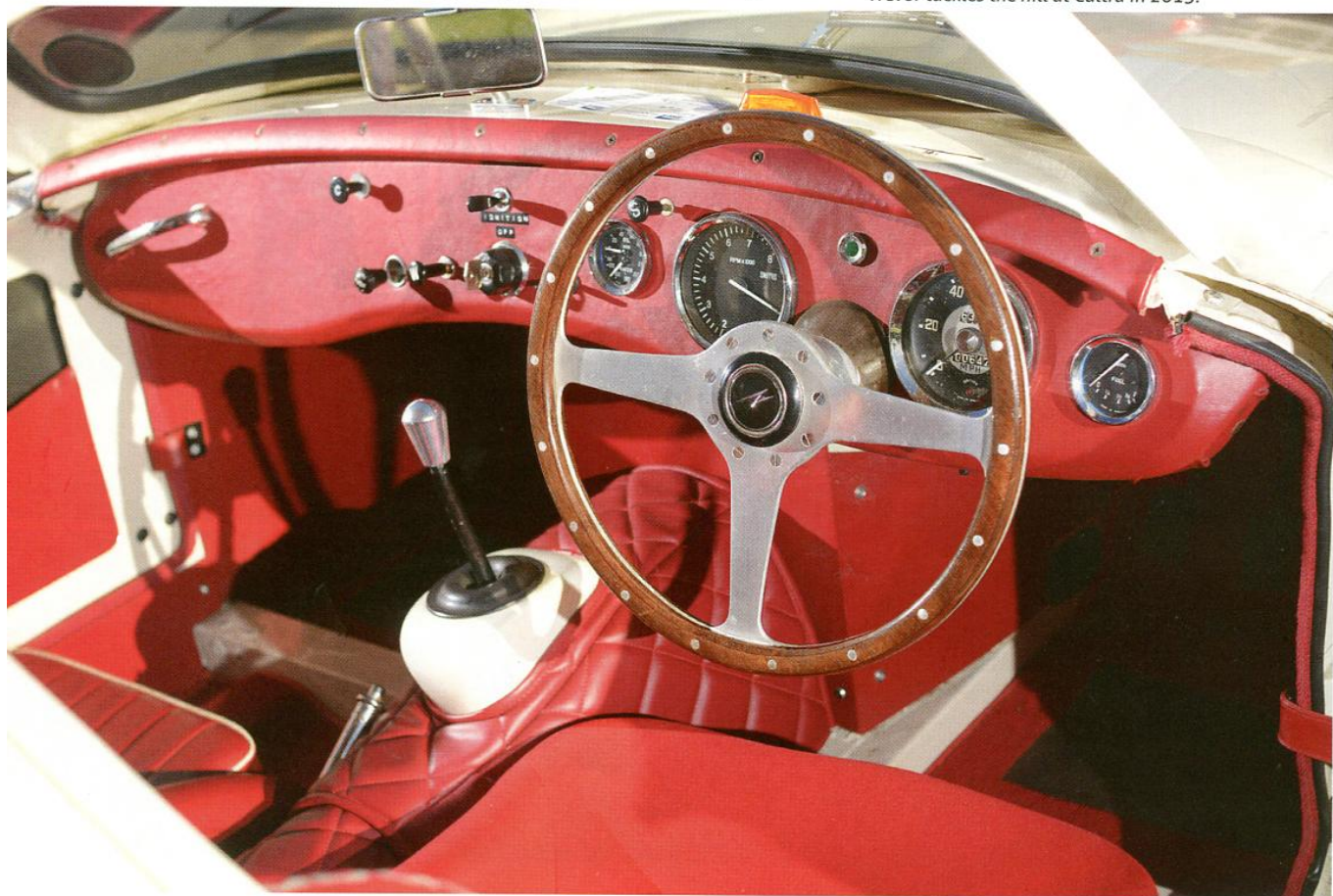
Unlike many racers, this one's beautifully finished inside, although very much still focused on the task at hand: speed.