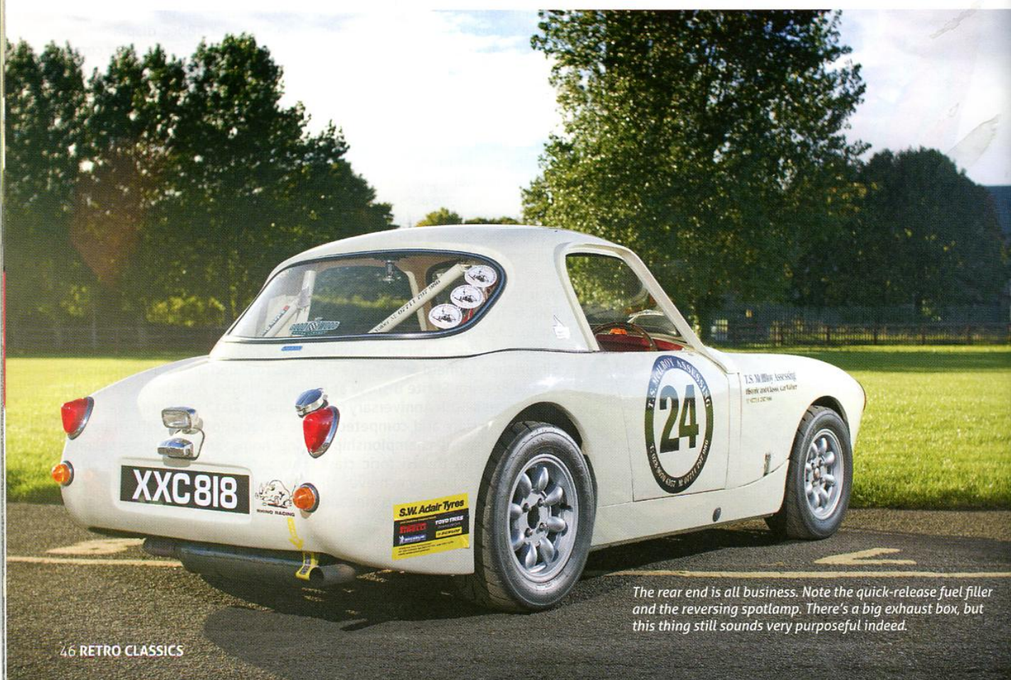
The rear end is all business. Note the quick-release fuel filler and the reversing spotlight. There's a big exhaust box, but this thing still sounds very purposeful indeed.