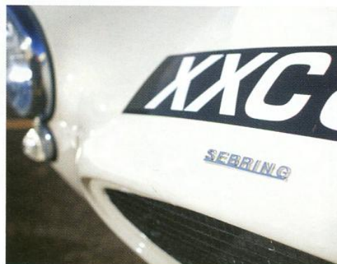
The long-distance races at the Sebring circuit in Florida were the scene of many of the Sprite's early motorsport victories, producing lots of public demand for this capable little sports car.